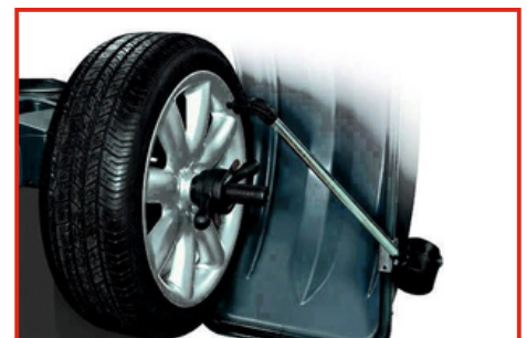
MEASURING ARM FOR THE RIM WIDTH